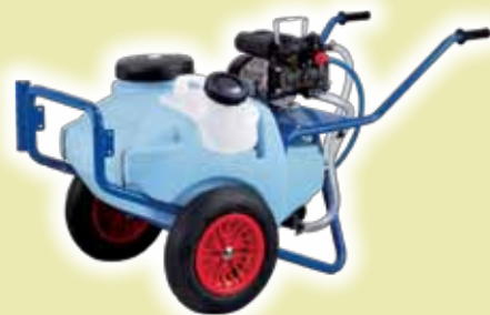
Trolley with tank 130 l + pump